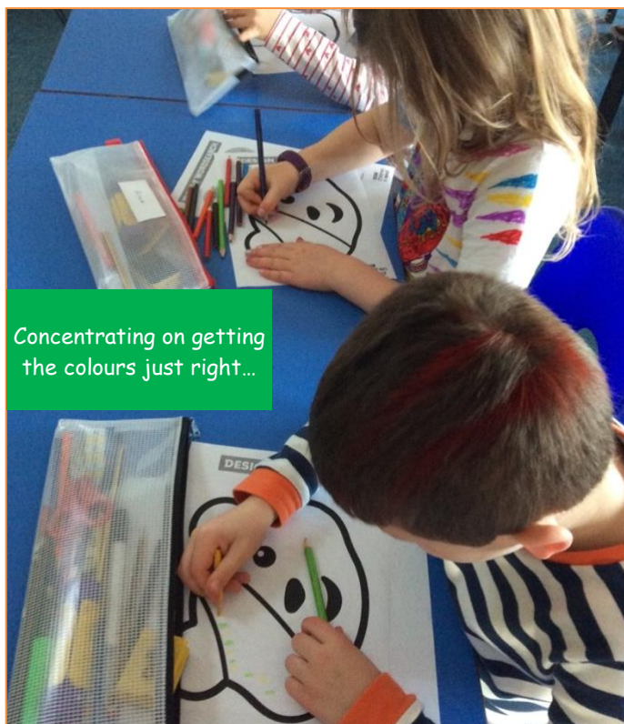
Concentrating on getting the colours just right...