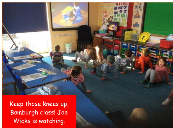
Keep those knees up, Bamburgh class! Joe Wicks is watching.