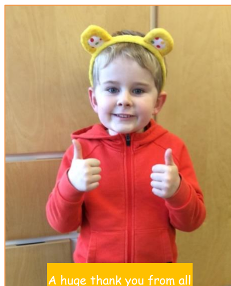
A huge thank you from all of us